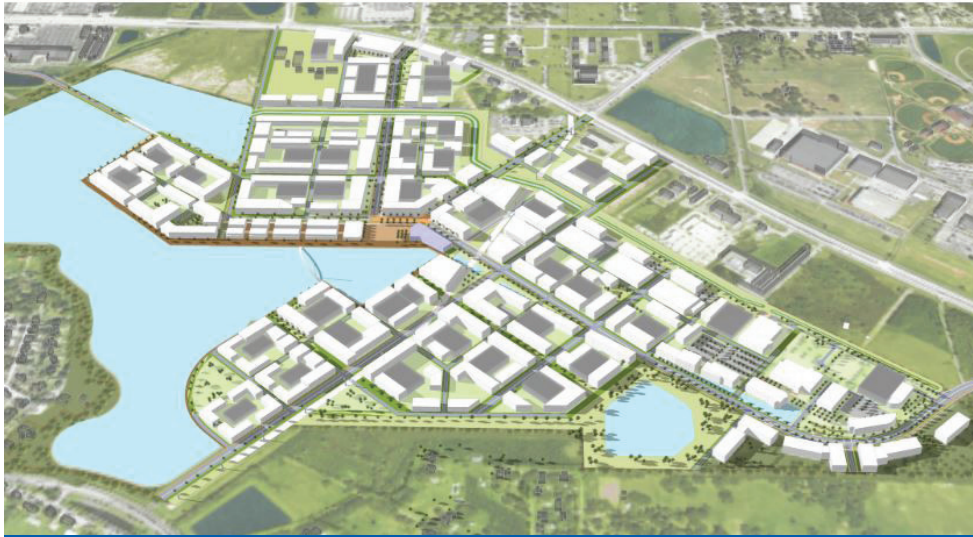
Rendering of Neo City technology district and reservoir.

A collaborative project between TOHO WATER AUTHORITY and OSCEOLA COUNTY to construct a 400 MILLION GALLON reservoir.